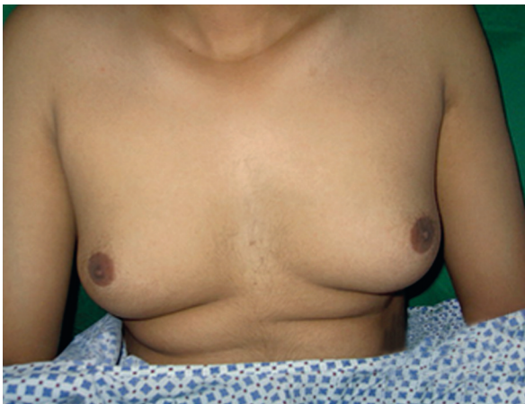
Fig. (3-A): Preoperative.