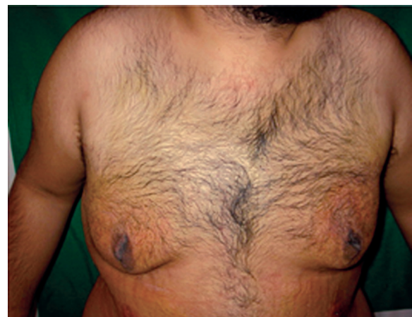
Fig. (4): Preoperative and postoperative photo of huge gynecomastia.