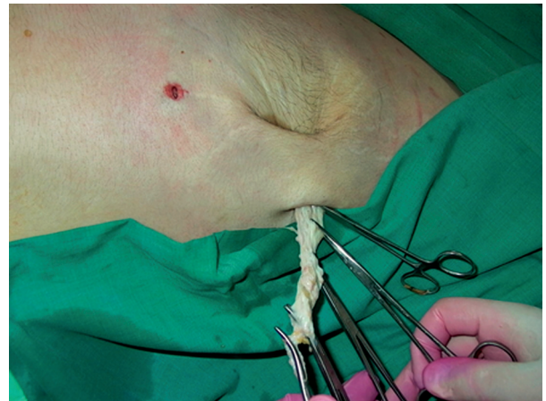
Fig. (2): Glandular removal through axillary incision of liposuction.